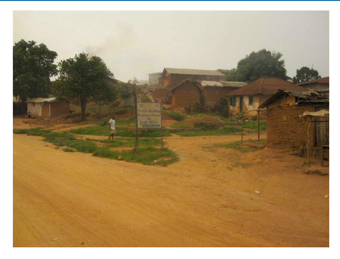
The Peacebuilding Resource Center in Voinjama.