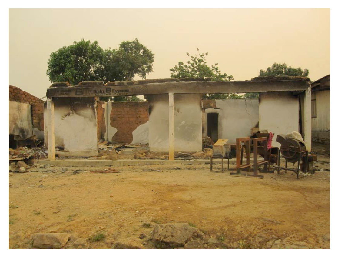
Burned shop.