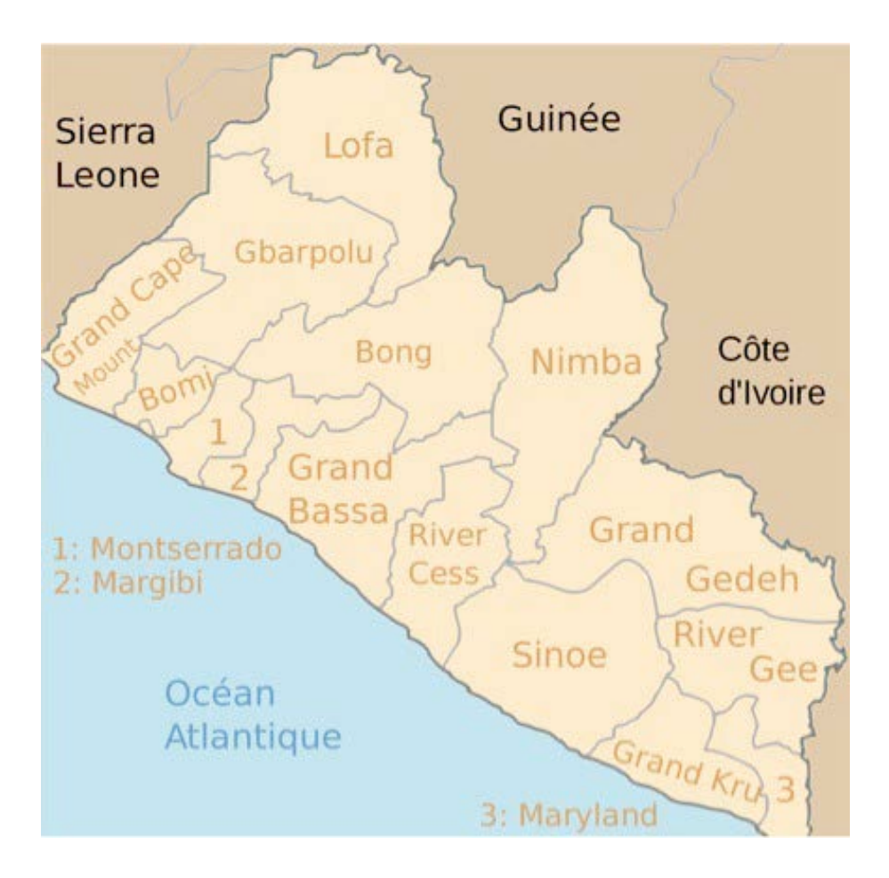
Map of Liberia