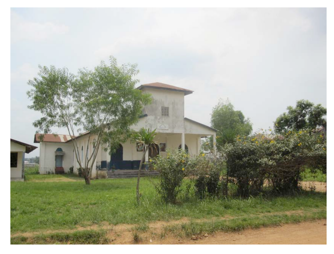
Christian church.