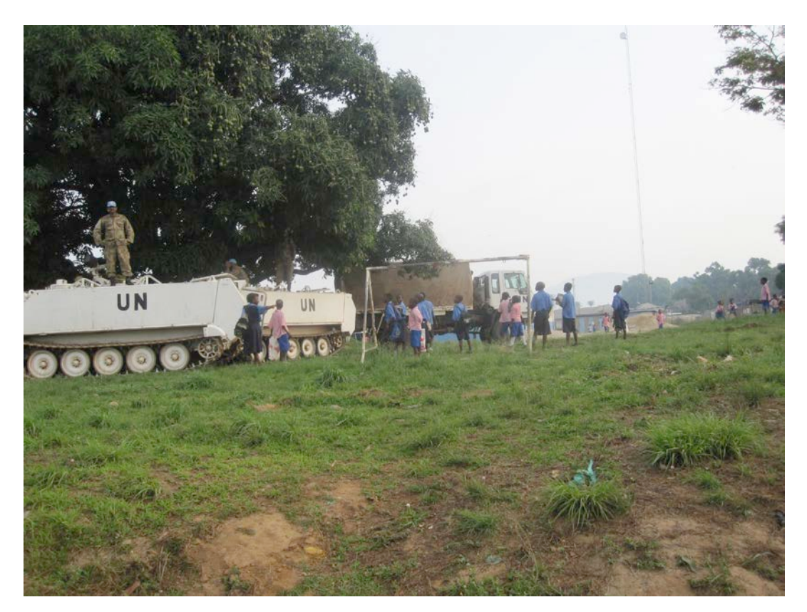
UN Troops in the schoolyard.