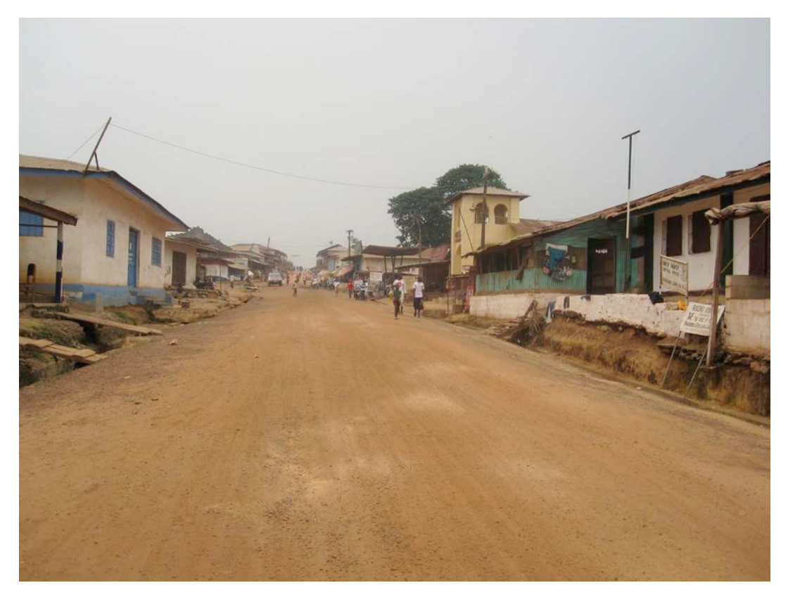
Main street in Voinjama.