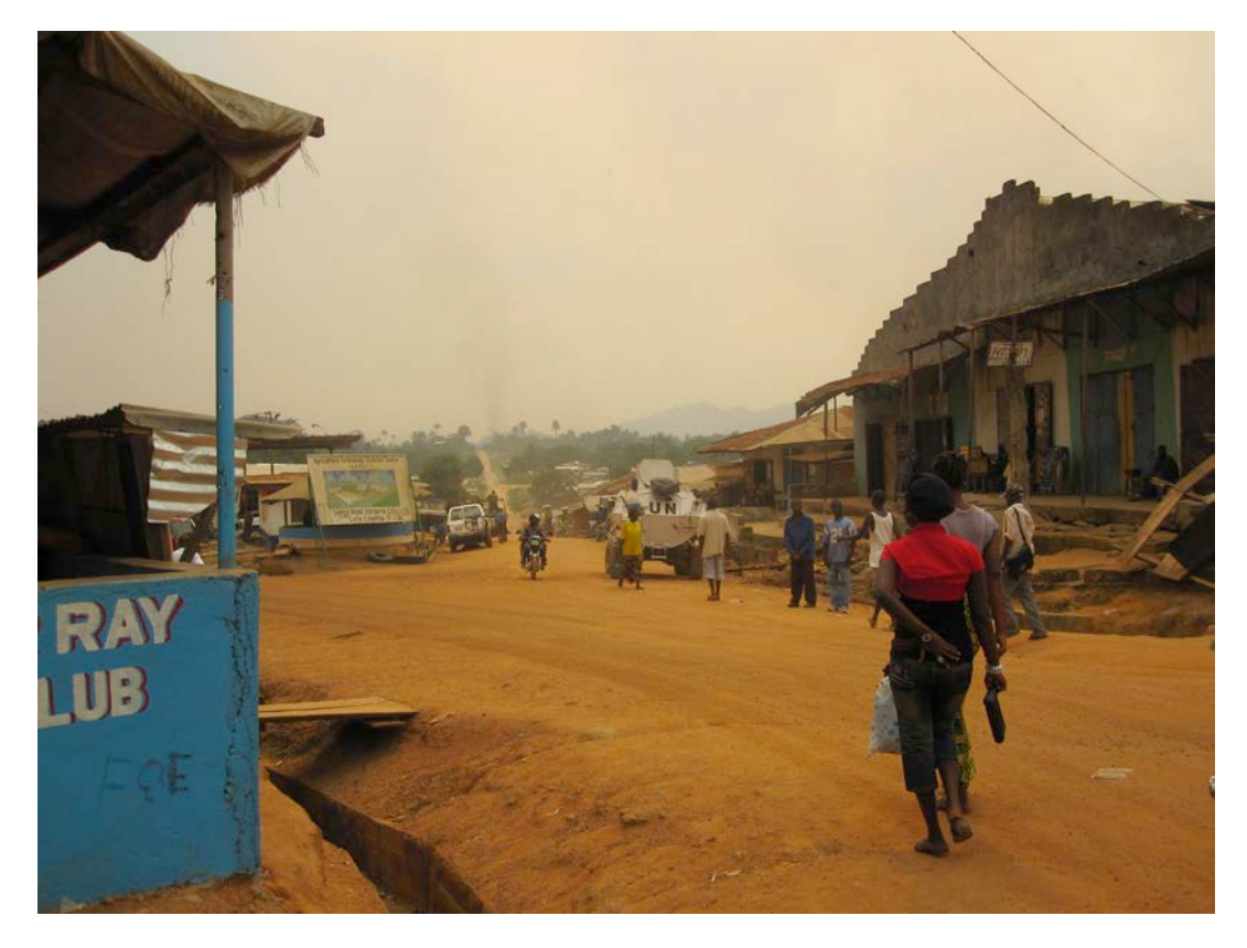
Central intersection in Voinjama.